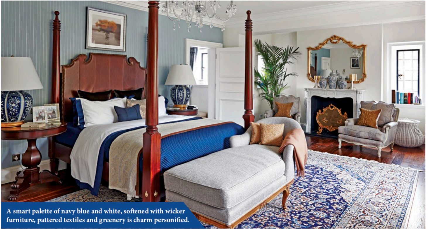
A smart palette of navy blue and white, softened with wicker furniture, patterned textiles and greenery is charm personified.