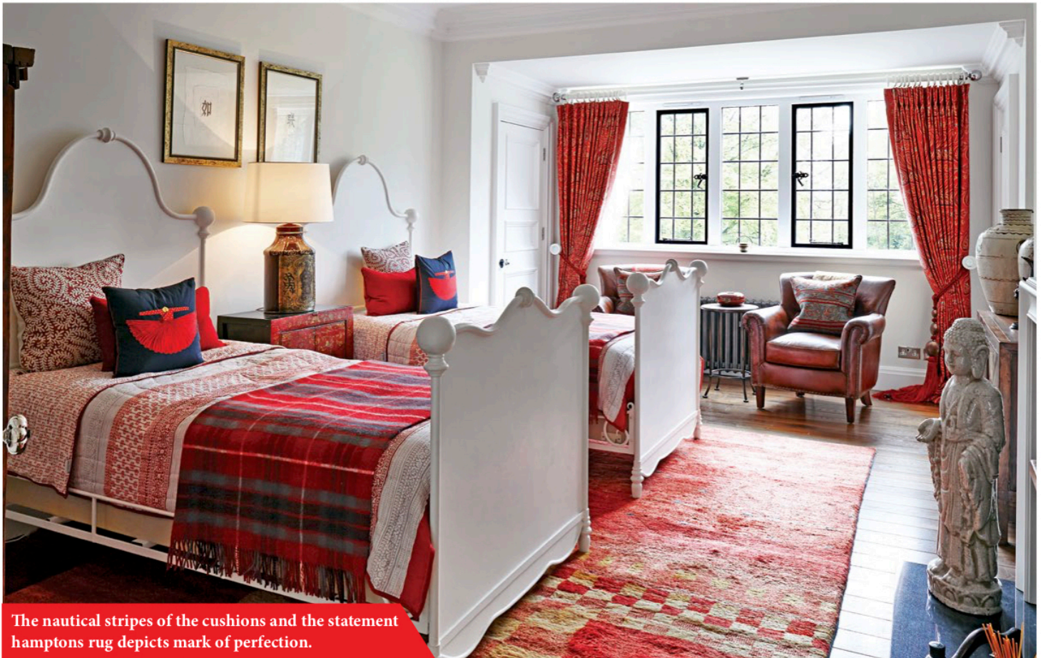
The nautical stripes of the cushions and the statement hamptons rug depicts mark of perfection.