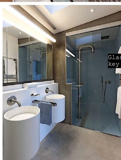
Glass and light play a key role in the apartment

Although the past is embraced, the present is very much at home – even if you can't see it, being discreetly incorporated into the design. 'The apartment is very much a bachelor pad and had plenty of the latest technology,'