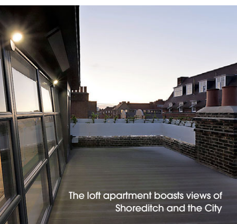
The loft apartment boasts views of Shoreditch and the City