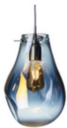
Light by Poliform , £360. poliformuk.com