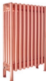
Radiator by Bisque , from £426. bisque.co.uk