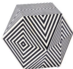
Stool by Libra , £499. thelibracompany.co.uk