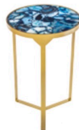
Side table by Andrew Martin , £250. andrewmartin.co.uk