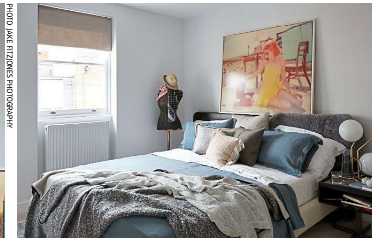
Art-felt: Each bedroom features unique art. Right: The guest room shower