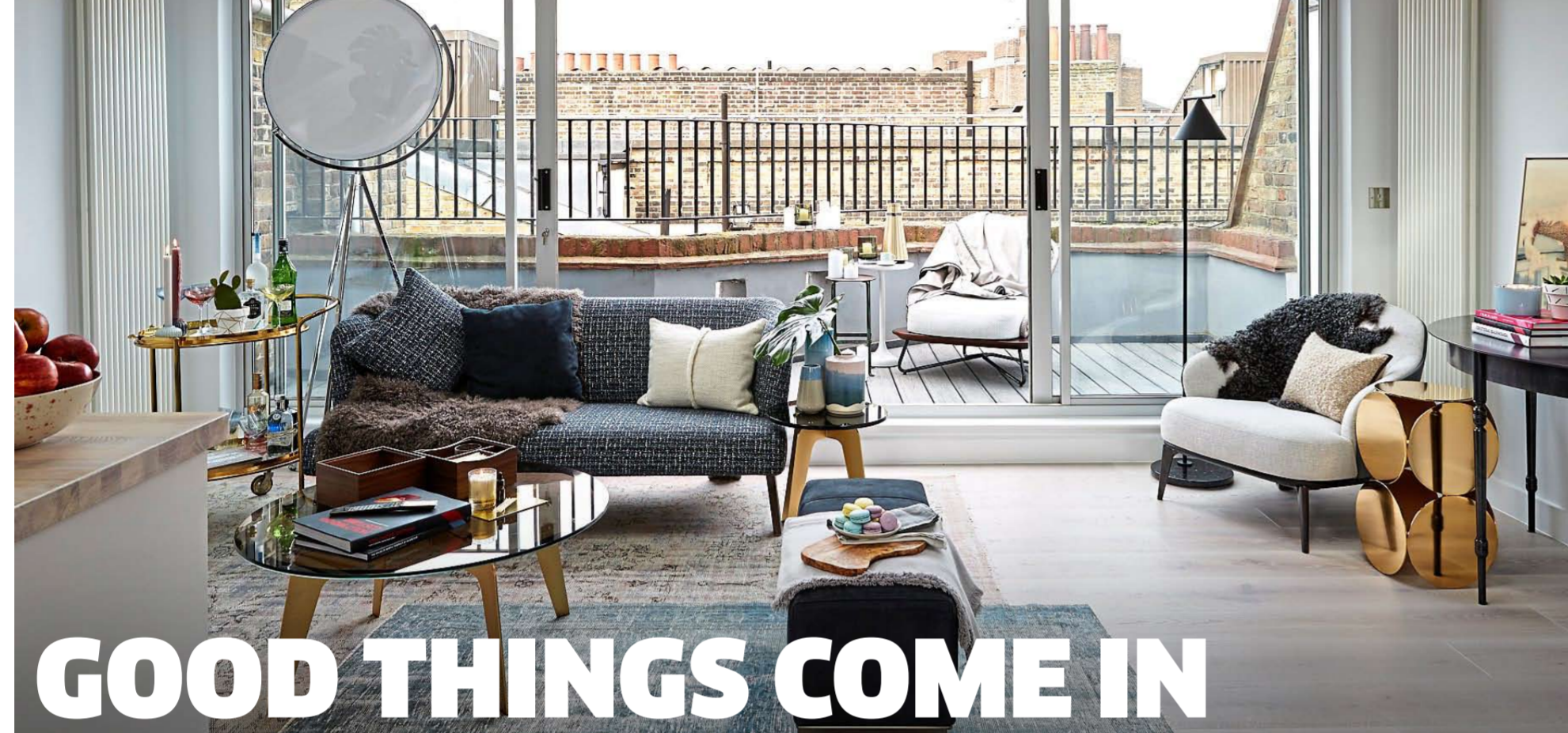
Bright idea: Part of the remit was to allow more natural light to flow through the apartment

He also took inspiration from Californian music festival Coachella.